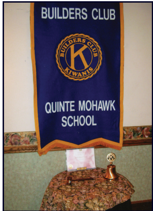
Photo displays the new banner, gong and gavel as well as the official charter for this brand new Builders Club.

The Kiwanis Club of Belleville benefited from our funding support for chartering a new Builders Club in Quinte Mohawk School in June, 2008. The club's first major project was to raise funds to purchase Christmas gifts for needy children in the community. Students raised over $1700, spent $1300 on Christmas gifts and retained the balance for future projects. What a great start to making a difference!